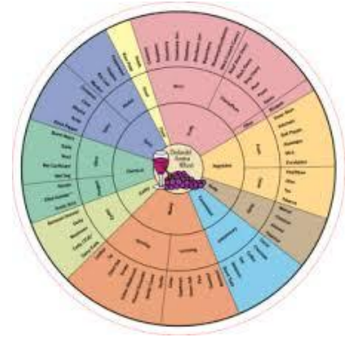
ZAP Zinfandel Aroma wheel