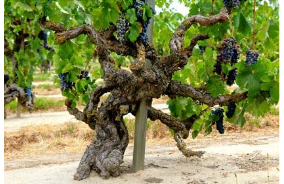
Majestic, own rooted “old man” Lodi Zinfandel (planted in 1901) in Mohr-Fry Ranches’ Marian’s Vineyard (Lodiwine.com)