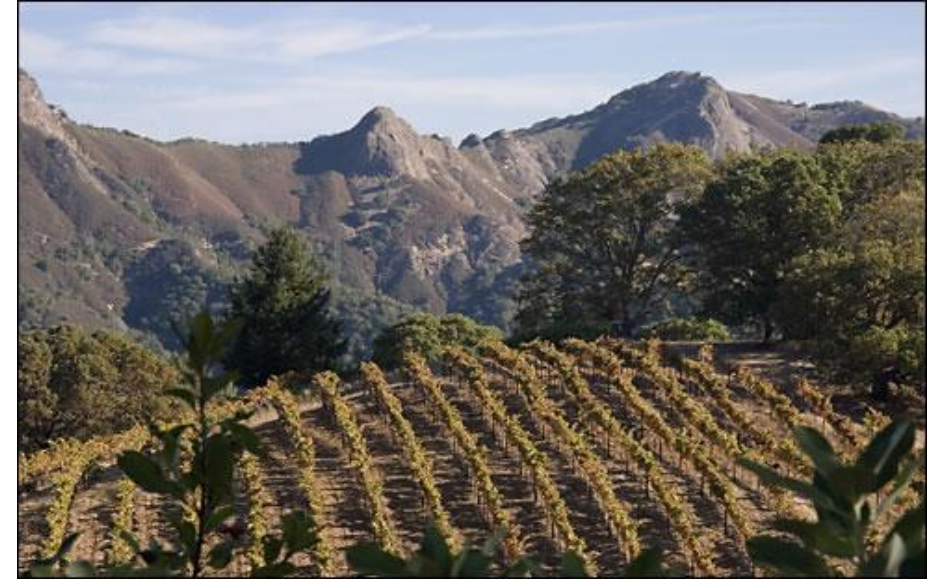
A Zinfandel Vineyard in Rockpile.